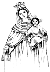
Our Lady of Mount Carmel